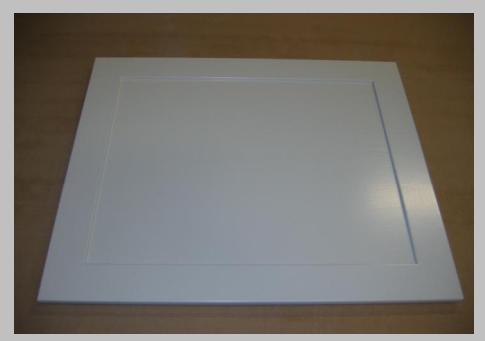
Finished, white-painted MDF door.