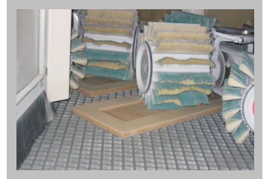
Brush sander equipped with Flex Trim sanding heads and sanding strips.