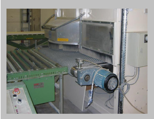
Brush sanding machine.