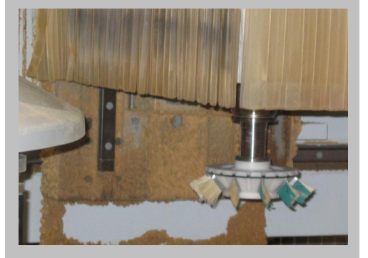
Sanding solution implemented on a CNC machine.

Surface sanding on profiled doors in through feed