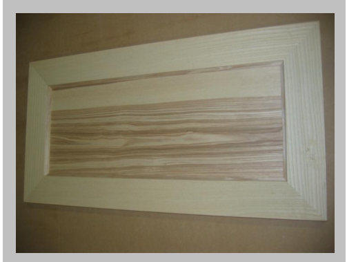
Sanded ash wood door without hand sanding being used.

Surface sanding on profiled doors in through feed